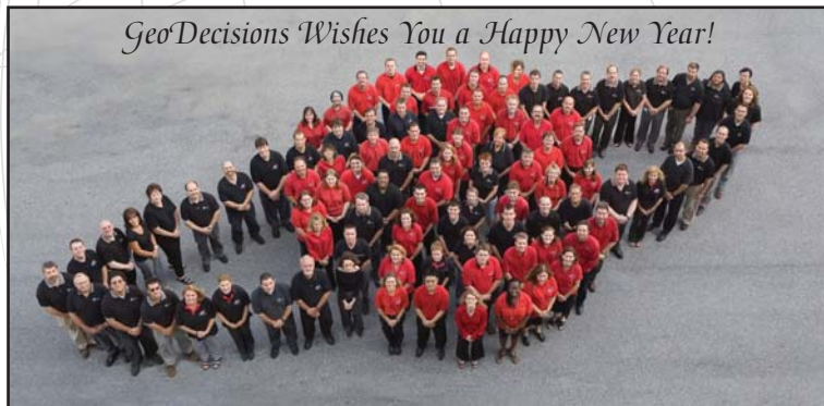
As part of our 20 th anniversary celebrations last year, nearly 100 people had a blast forming the GeoDecisions logo.