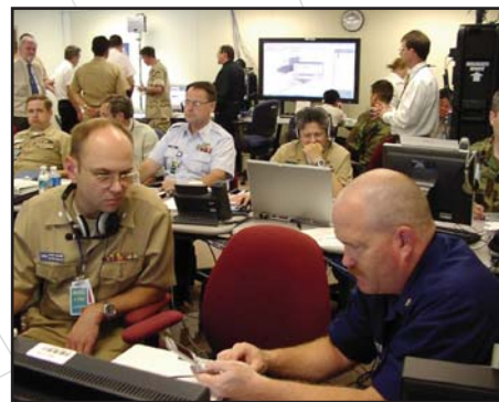
Operators participate in CWID.

CWID is an annual event sponsored by the Joint Chiefs of Staff that enables U.S. Combatant Commands and the international community to identify and evaluate new and evolving technologies that can improve warfighting capabilities.