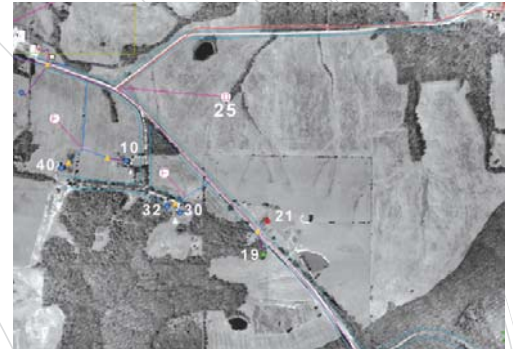
This example displays how aerial ortho-photography is used as a base reference for locating and spatially enabling electrical assets in the creation of GIS features.

GeoDecisions recently teamed with Daffron, based in Bowling Green, Mo., to provide rural electric cooperatives the ability to better manage their data. Daffron offers solutions specifically designed for utilities, including integrated consumer information, materials, financial management, e-business, and work order automation software. GeoDecisions complements Daffron's services by providing utility mapping services and GIS. With the GIS, users can perform various queries, quickly compile data and generate accurate reports, check flow and connectivity, and better manage workforce and assets.